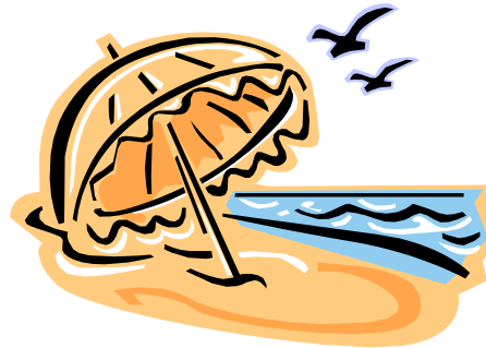
HRA Summer ESCAPE Program

***Kindergarten, first grade, and second grade children require a labeled change of clothes and a rest mat.***